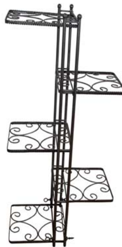
After extend the shelves