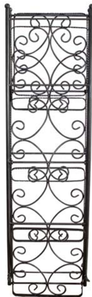
1 pc – Foldable Shelves