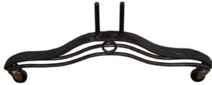
2 pcs – Bases